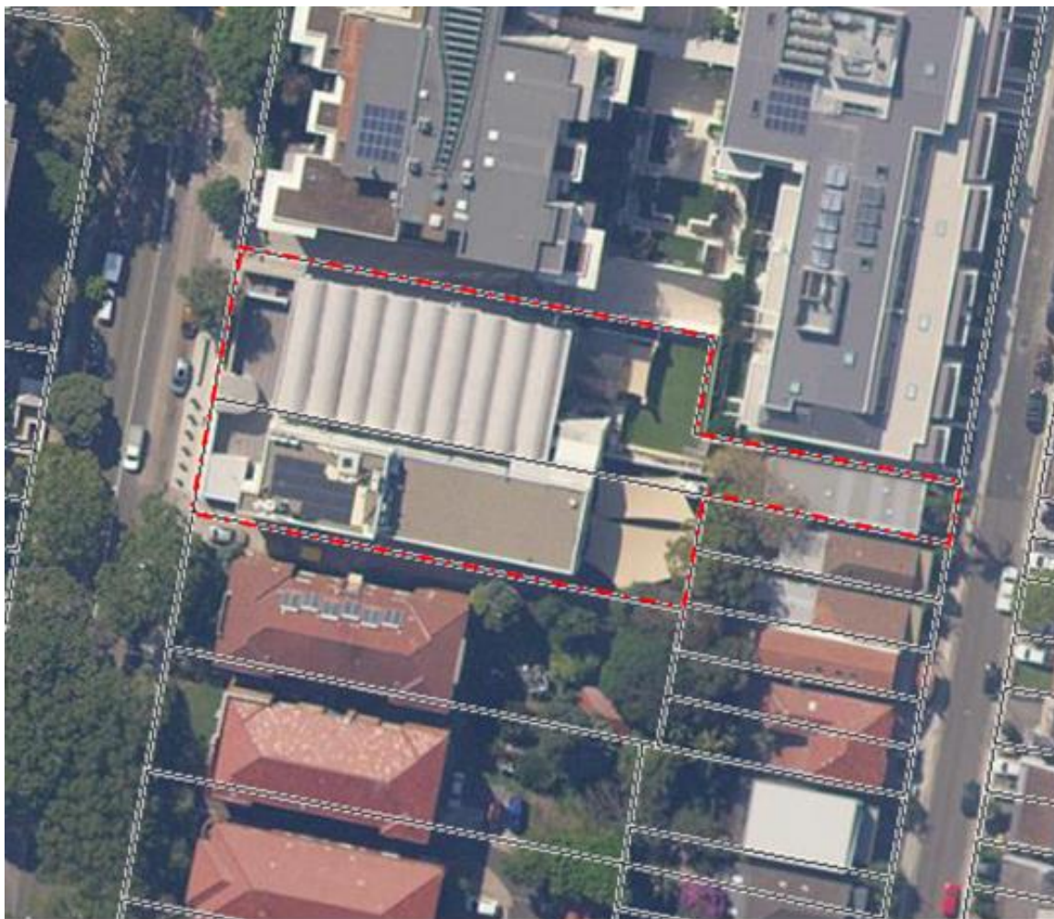
Figure 1 The site (site outlined in red)